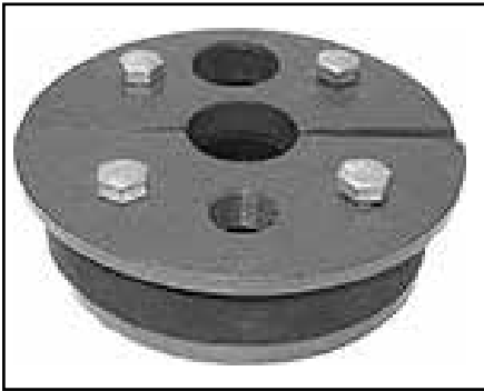
Single Drop Pipe Split Top Plate