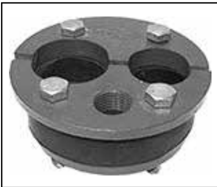
Double Drop Pipe Split Top Plate