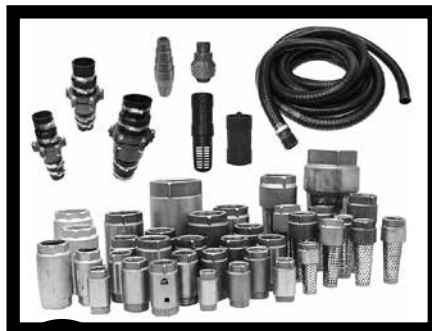
11 Check & Foot Valves Pages 132-143