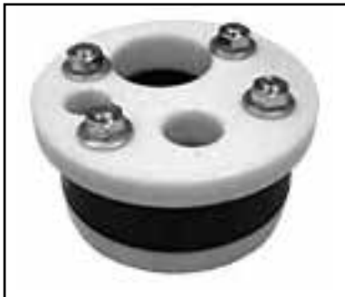
Plastic Well Seal