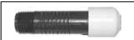
Well Seal Vent