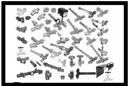
5 Tank Tees, Tee Kits, Tee Acc. Pages 71-88