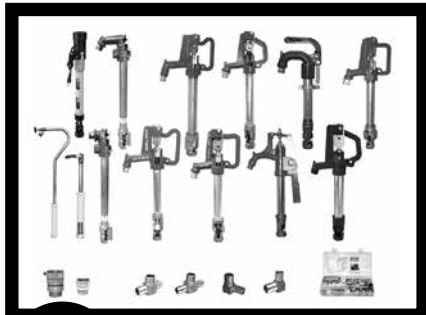
1 Frost Proof Yard Hydrants Pages 8-38