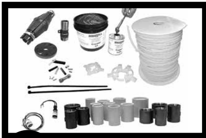
7 Splice Kits, Torque Arrestors, Couplings Pages 97-105