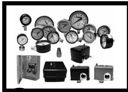
6 Pressure Switches & Gauges Pages 89-96