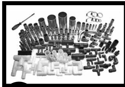
9 Insert Fittings & Clamps Pages 115-129