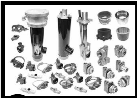
2 Pitless Units, Kits, Adapters Pages 39-61