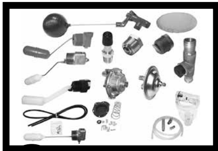
4 Floats, Air Volume Controls Pages 67-70