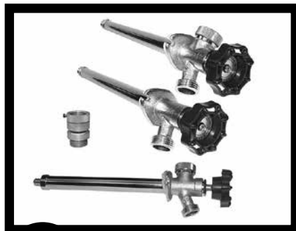
10 Frost Proof Wall Faucets Pages 130-131