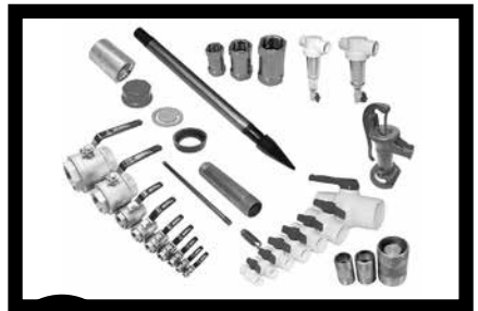
8 Well Points, Pump Rod, Cup Leathers Pages 106-114